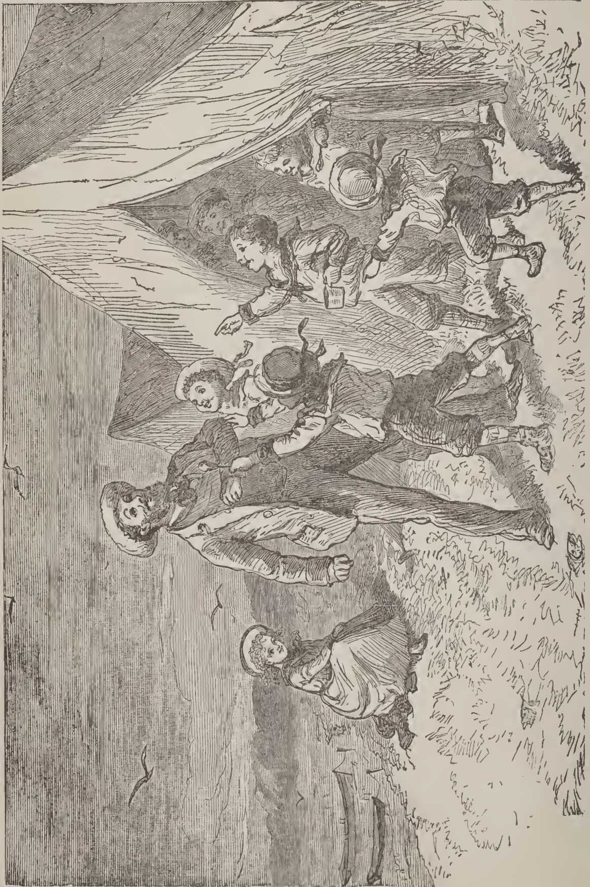
A CRASH, A SHOUT, A LAUGH, AND OUT CAME THE SAVAGES. — Page 99.